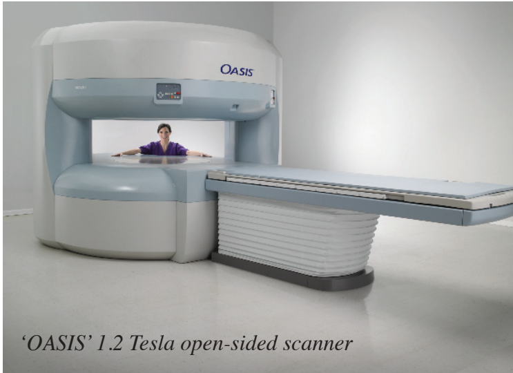
'OASIS' 1.2 Tesla open-sided scanner