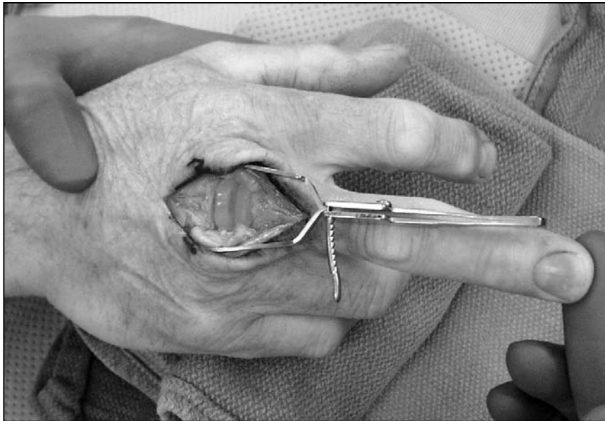
Figure 3 Silastic arthroplasty MCP joint with implant in place.