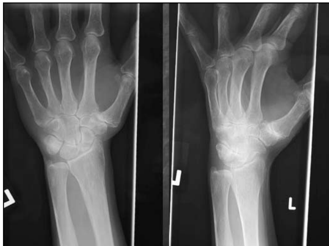
Figure 1. Radiographic appearance of osteoarthritis of the thumb carpometacarpal joint.

Currently, the most commonly used surgical procedures to treat thumb CMC osteoarthritis are soft tissue arthroplasty procedures which include resection of the trapezium with or without ligament reconstruction using either the flexor carpi radialis tendon, the extensor carpi radialis longus tendon or the abductor pollicis longus tendon. Alternatively suspensionplasties using tendons or suture materials have been devised to hold the thumb metacarpal out to length. Removing the trapezium allows the base of the thumb metacarpal to articulate against a soft tissue mass/scar with or without ligamentous reconstruction, eliminating painful bone on bone contact. This type of procedure, first popularized by Carroll, Littler, and Eaton 4,5 in the United States has been used for over 50 years with excellent results. Large prospective randomized series of surgical treatment comparisons have as yet not been able to determine a difference in outcome between these