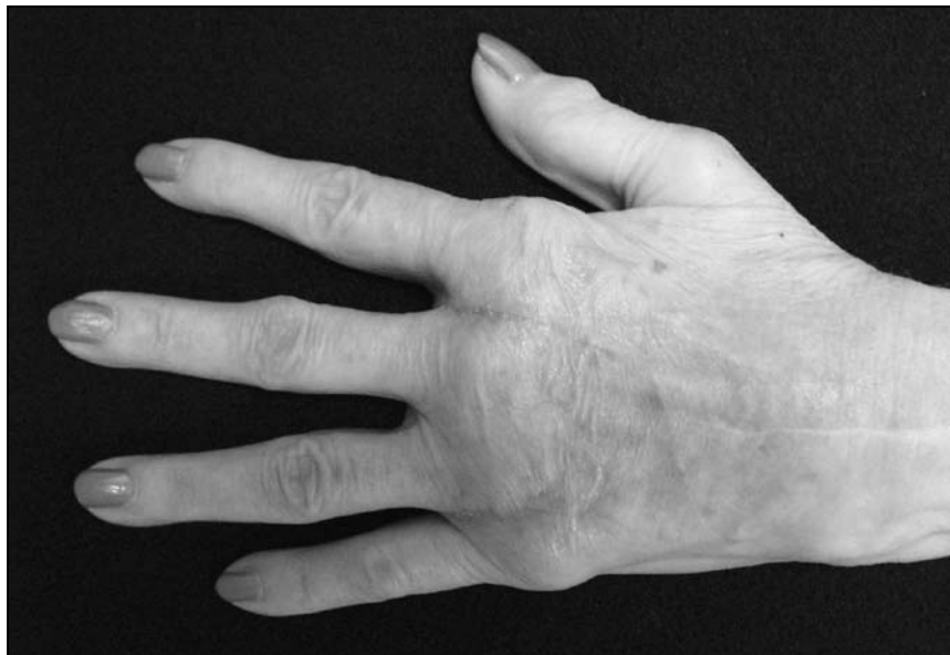
Figure 4 Clinical appearance with silastic arthroplasty in place.

different soft tissue procedures. 6 Surgery in these patients failing conservative care has given excellent outcomes for pain relief, improved function, and patient satisfaction.