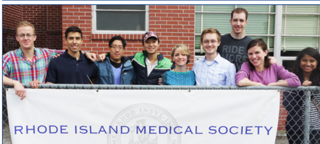
Above: State House press conference on health care, Brown MSS at the AMA, CPT update seminar, bike helmet distribution, medical student volunteers; Upper right: Meeting of RIMS membership committee