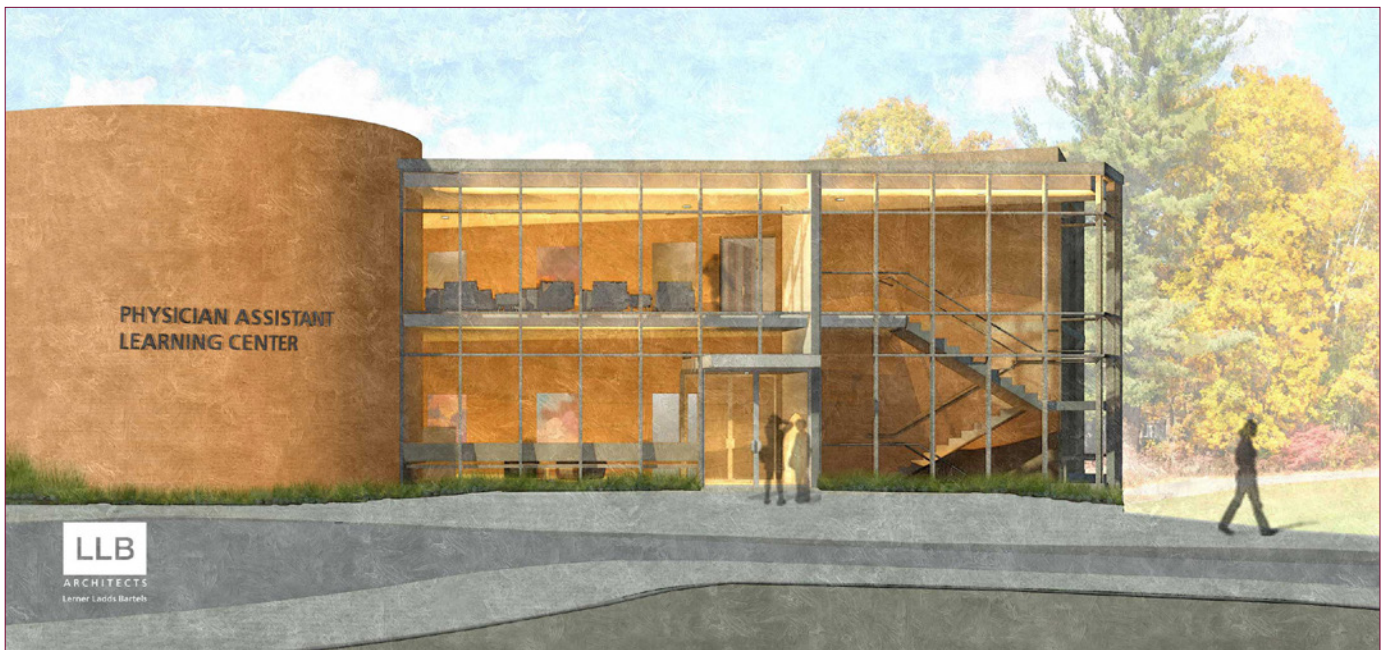
The planned School of Health Sciences will be housed in a new facility to be constructed this year on Bryant’s 428-acre campus in Smithfield.