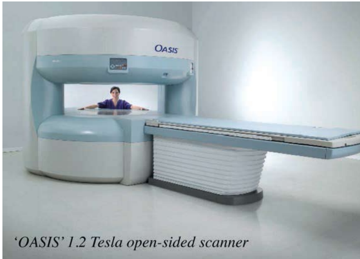
'OASIS' 1.2 Tesla open-sided scanner