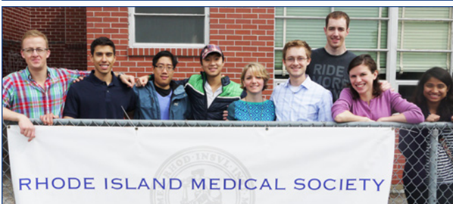
Above: State House press conference on health care, Brown MSS at the AMA, CPT update seminar, bike helmet distribution, medical student volunteers; Upper right: Meeting of RIMS membership committee