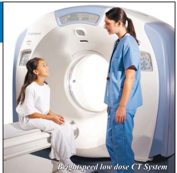
Brightspeed low dose CT System

525 Broad St. • Cumberland T 725-OPEN (6736) F 726-2536