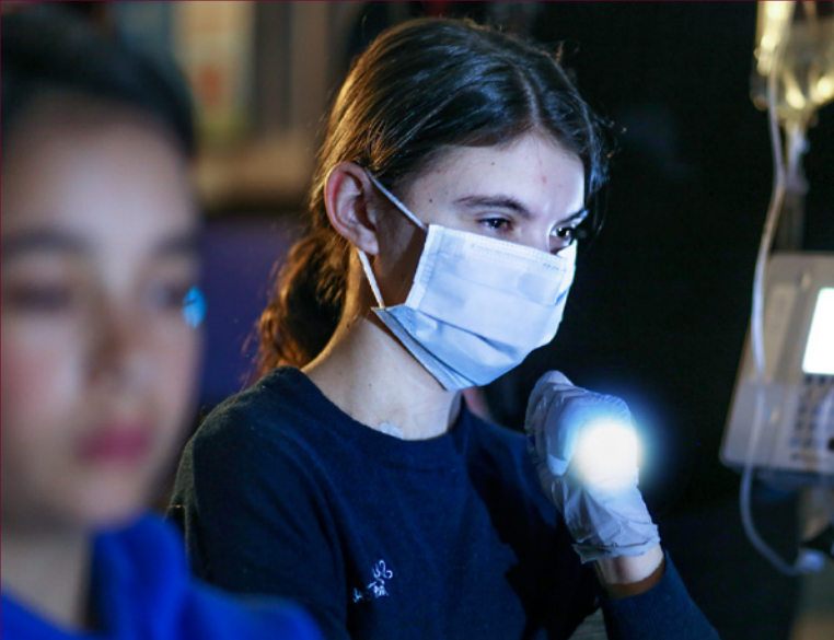
The Good Night Lights program takes place every night at Hasbro.

flashing light signals toward Hasbro to show patients they care. Patients gather in rooms at the hospital for this “Magic Minute” and flash lights back out to the community in response.