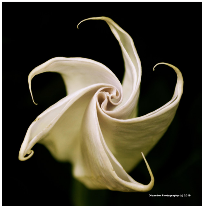
White Spiral Datura