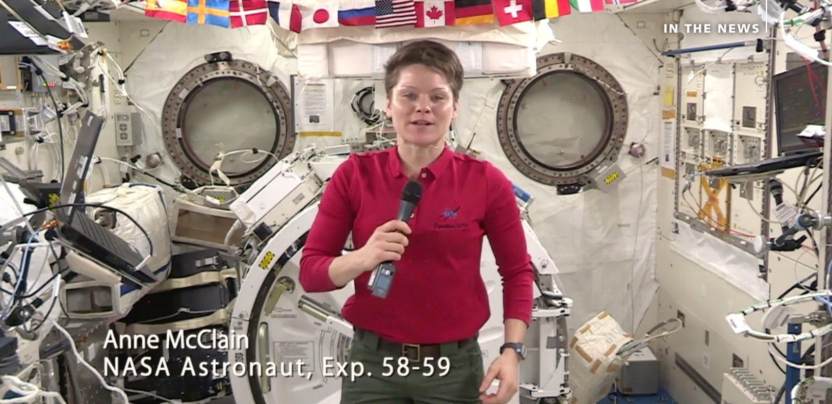
Anne McClain NASA Astronaut, Exp. 58-59