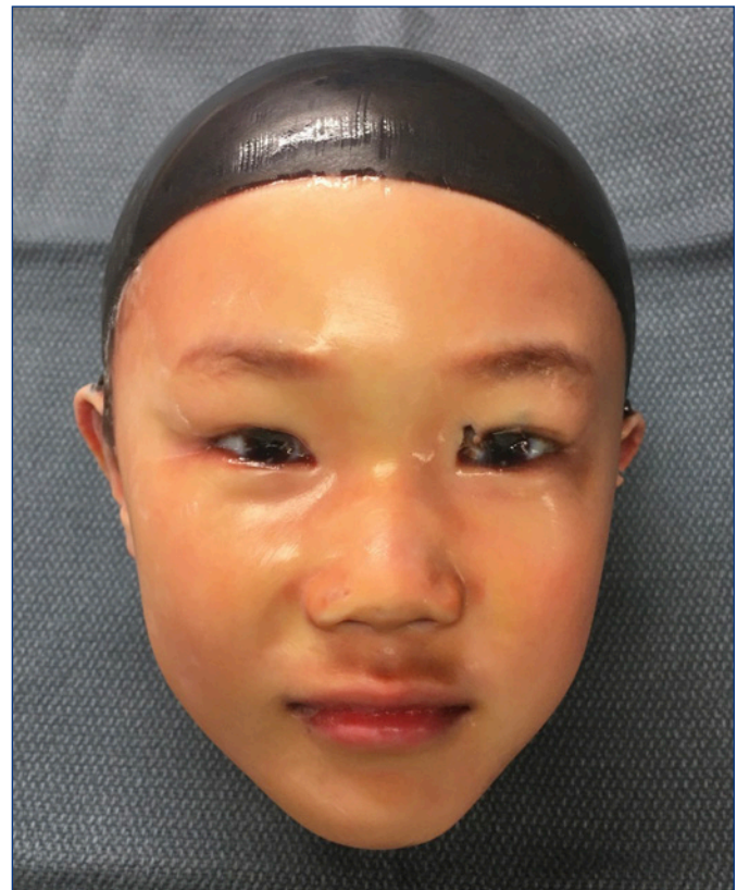
Figure 1. 3D printed full-color replica of a face. This capability offers numerous potential applications in healthcare, including visual guides for complex soft-tissue reconstruction, production of customized prostheses, and less invasive development of burn masks.