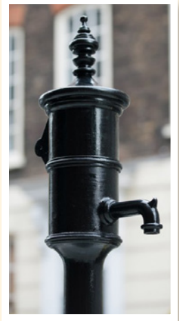
A replica of the infamous John Snow pump was reinstalled on Broadwick Street in Soho, London, in 2018.