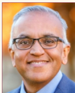
Asish K. Jha, MD, MPH