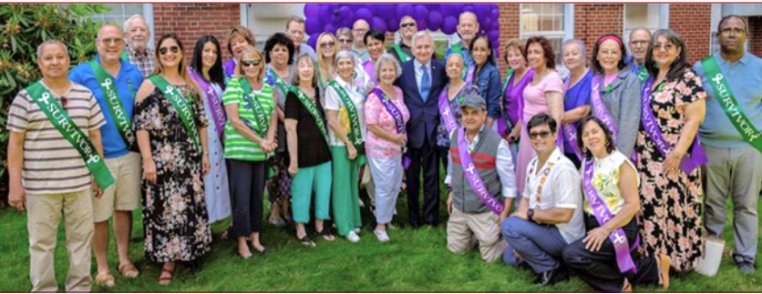
Sen. Jack Reed joined with cancer survivors, family, and staff on Saturday, June 21 in Kay Auditorium.

PROVIDENCE — Close to 100 cancer survivors, family members and friends, providers and hospital staff gathered recently at Roger Williams Medical Center (RWMC) to celebrate National Cancer Survivor Month, their cancer care journey, and mark the 30th anniversary of the Blood and Marrow Transplant and Cellular Therapy Program (BMT).