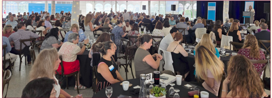
Blue Cross & Blue Shield of Rhode Island (BCBSRI) and the Greater Providence Chamber of Commerce at celebration held at the Crowne Plaza July 17th.

"At Blue Cross, we're proud to recognize – and celebrate – local businesses that are dedicated to the health and well-being